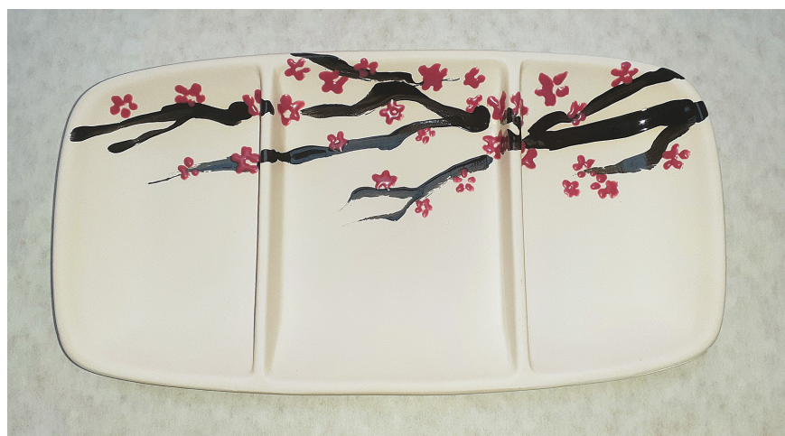
Geometrix Divided Dish DB24809

This technique can work on any other piece of bisque. Here is an example: